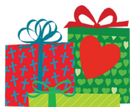
Gifts from the Heart Christmas Shop

Thank you to everyone who donated toys, goodies, gift cards, and money for Gifts from the Heart Christmas Shop and the Devereux Christmas Stockings! Your generosity will help make many children's Christmas more joyous!