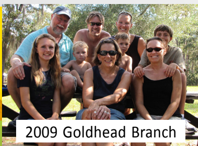
2009 Goldhead Branch