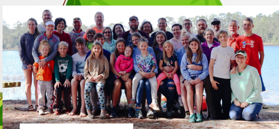
2019 Fore Lake