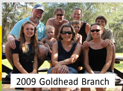
2009 Goldhead Branch