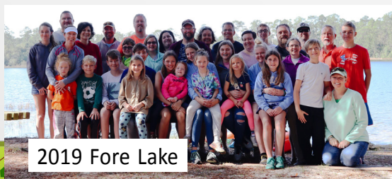
2019 Fore Lake